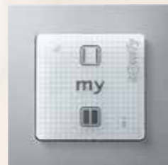
Smoove RTS wall mounted control (Open/Close)*

*Choice of modules and frames: modules available in 3 finishes, frames available in 7 finishes