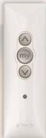
Wall mounted remote