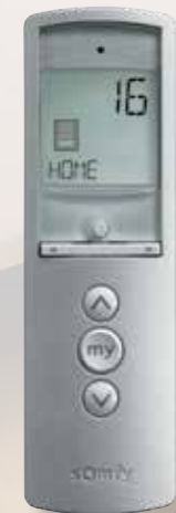
16 Channel remote

In addition to acting as the stop function when using your remote, the "my" button on Somfy controls allows easy programming of your preferred blind / curtain position.